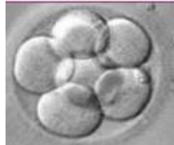
6 cell embryo: 3 days after fertilization