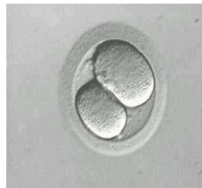
2 cell embryo: 2 days after fertilization