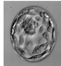
Blastocyst: 5 days after fertilization