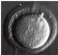
One day after fertilization

Sometimes all embryos are frozen and transferred at a later time. See the section on "Freeze All Cycles".